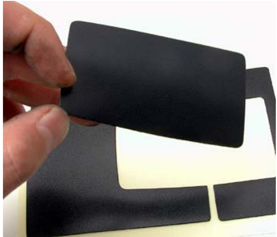
8. Peel Skinslove from paper backing.